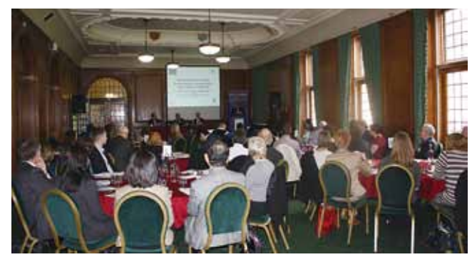
JSPS London Office

quality of people's lives as they grow older in urban environments.