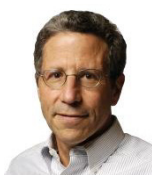
Eric S. Maskin

Professor, University of California, Berkeley