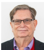
George F. Smoot