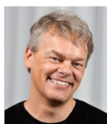
Edvard I. Moser

Nobel Laureate in Physiology or Medicine 2014