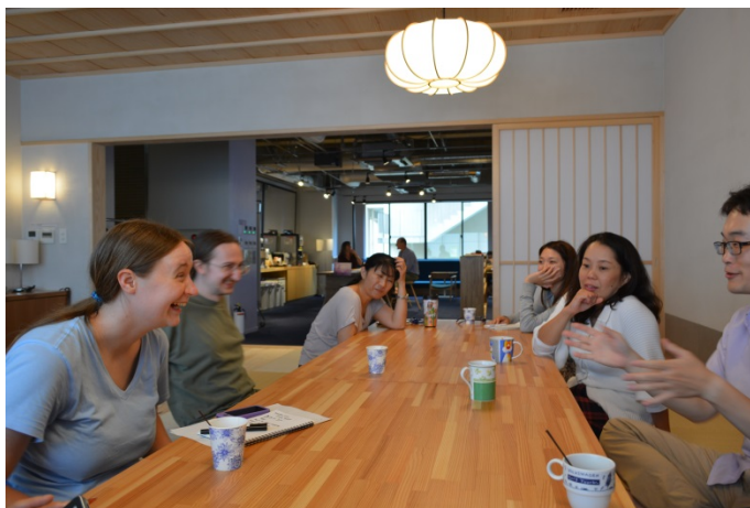
Figure. Discussion at tea break