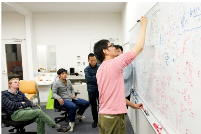
Figure. "Interface" group consisting of 7 young theorists and mathematicians, connecting between traditional materials science and mathematics.