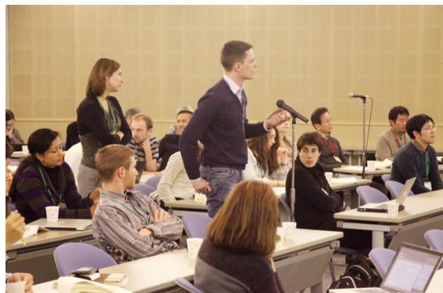
Figure. Winter school on advanced immunology jointly organized by IFRcC and S IgN (Singapore). The 2014 school was held in Awajishima, Japan on January 19-23.