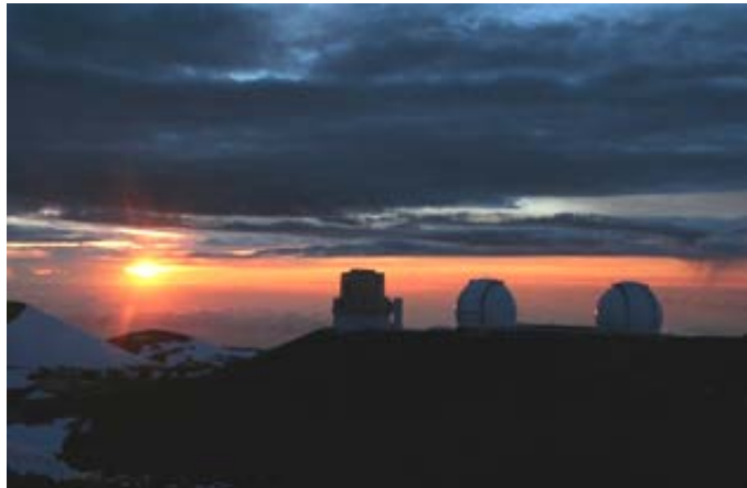
Figure. Subaru Telescope (left) on Mt. Mauna Kea, Hawaii Island