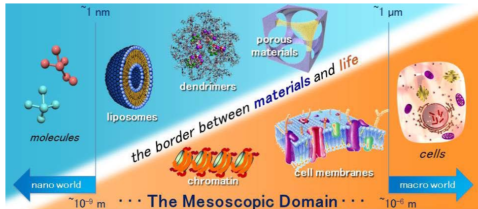
Figure. Research fields of "Meso-scopic" science in materials science and cell biology.

For example, studies of chemical biology, extracellular matrix, in vitro differentiation induction of germ cells, carcinogenesis by reprogramming factors, neural stem cells, and so on.