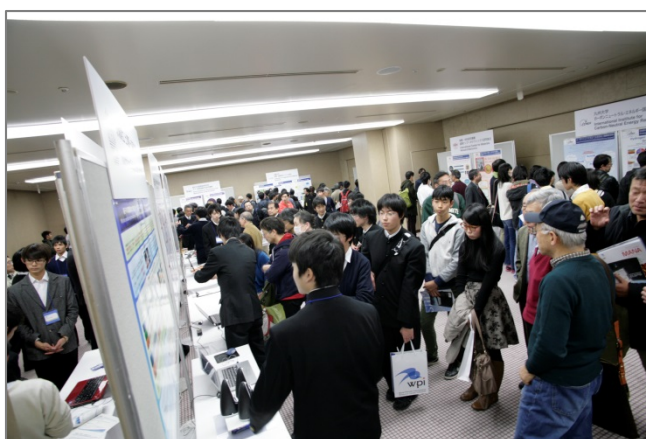
Figure. Crowd at poster presentations of high school students.