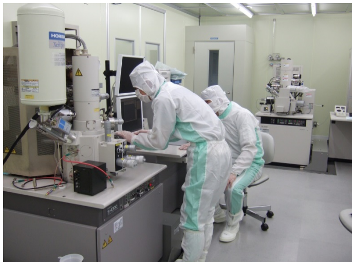
Figure. MANA Foundry