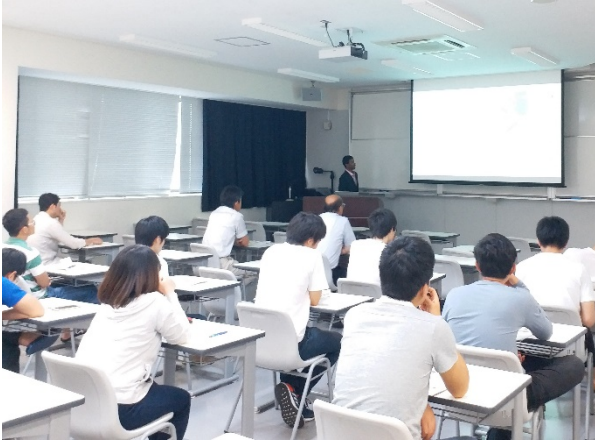
● Open defense of the doctoral dissertation