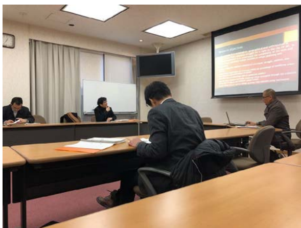
Presentation at the final defense