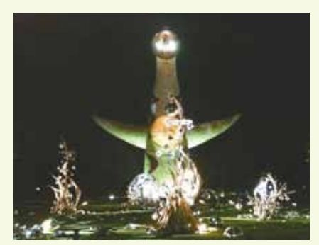
A rare site: Sun tower at night

The park is probably most well known for its iconic Tower of the Sun (taiyou no tou) designed by the late Taro Okamoto, one of the largest artwork pieces in Japan. The Tower looms over the park like some giant pretenatural creature and can be seen clearly from the Osaka Monorail as well as the Osaka University Hospital.