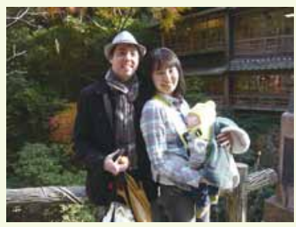
Walking in Minoh with baby in tow

reversed! The Takarazuka Revue is an all-female theater troupe that began in 1914 in Takarazuka, Hyogo Prefecture. The city is near Itami Airport. Half of the actresses specialize in portraying men; they cut their hair short and learn to master masculine behavior and speech. The other actresses specialize in portraying females. There are five troupes in total (Flower, Moon, Snow, Star, and Cosmos) putting on a variety of different shows at any given time. Shows are elaborately costumed and choreographed and give off a Vegasstyle air that leaves you breathless when the finale is over. Highly recommended!