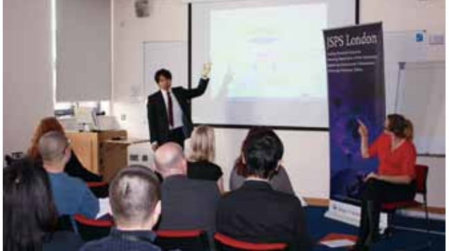
Briefing at University of Bristol

During the period of 11 October through 9 November, the staff of JSPS's London Office made a series of visits to eight UK universities across the length of the UK starting with the London