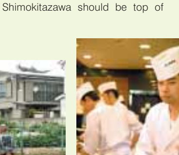
The best sushi in Setagaya-ku

your list. A super-trendy area in Setagaya-ku, Shimokitazawa offers everything from bars, cafes, second-hand clothes and antiques all from aged shops in labyrinthine streets.