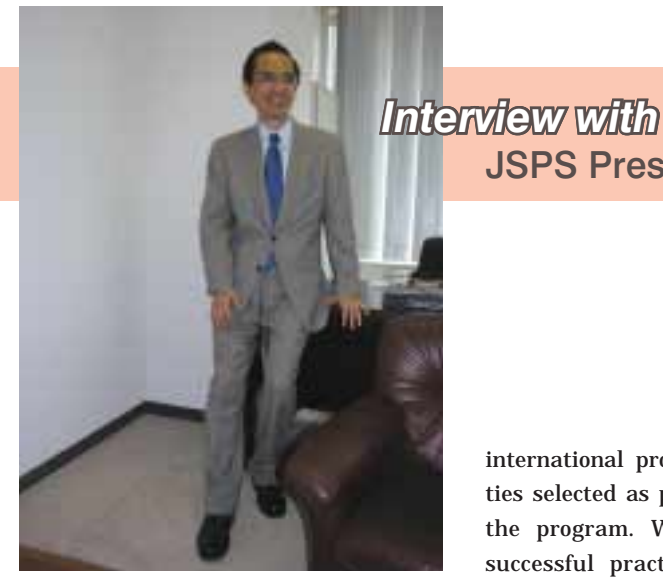
Prof. Motoyuki Ono

What do you think of the overall state of internationalization within Japanese universities?