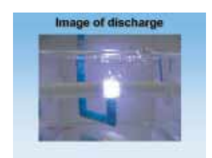
Generation of electric plasma discharge in aqueous solution

In my PhD course, I was interested in bio-processes as well as plasma. Connecting the two fields is what makes my present research so attractive. Nevertheless, many of the problems we're working on now are very new to me, so from time to time can be a really hard nut to crack.