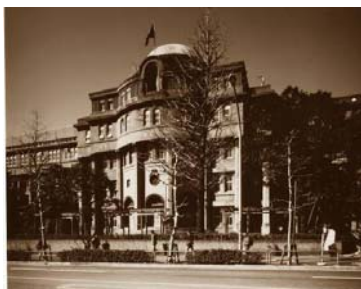
130 YEARS OF TRADITION

Our Global Common Project is to establish an “Intellectual Global Common”, where people from all over the world can gather to advance research and education. We will form a foundation for transmitting Japanese culture, technology and intellectual property to the world. Under the educational policy of “strengthening the individual,” we will develop our students’ ability to play an active role in international society, in multinational environments. Through these efforts, we will contribute to the sustainable growth and prosperity of the world. Under this scheme, we aim to accept 4,000 students from abroad and send 1,500 students into the world by the academic year 2020. Taking advantage of this project, Meiji University will move forward to become more internationalized and further improve its quality of research and education to become one of the world’s top universities.