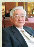
Dr. Toshihide Maskawa Nobel Prize in Physics 2008