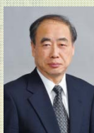
Dr. Makoto Kobayashi Nobel Prize in Physics 2008