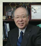
Dr. Ryoji Noyori Nobel Prize in Chemistry 2001