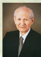
Dr. Osamu Shimomura Nobel Prize in Chemistry 2008