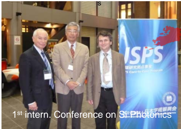
1 st intern. Conference on Si Photonics