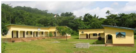
Fieldwork in overseas stations