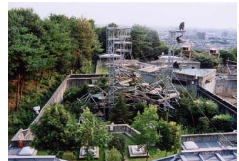
Analysis in laboratories