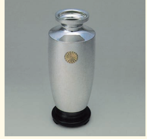
Imperial Gift until the 34th presentation ceremony, a silver vase bearing the imperial crest