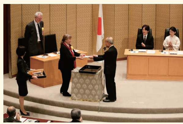
The Presentation Ceremony for the 2019 Prize (Recipient: Dr. Naomi Ellen Pierce )

The presentation ceremony is held in the presence of Their Imperial Highnesses Crown Prince and Crown Princess Akishino. A Commemorative Symposium is held in conjunction with the ceremony.