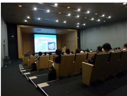
Monitoring and Assessment Session

Parallel sessions were held on two themes: “Monitoring and Assessment” and “Ecological Management and Restoration.” Top-notch scientists from Asian countries who served as coordinators and young researchers gave presentations and engaged in vigorous Q&A discussions.