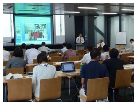
Ecological Management and Restoration Session