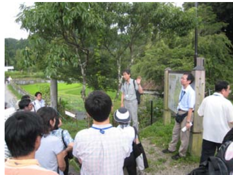
At Kaisho Forest