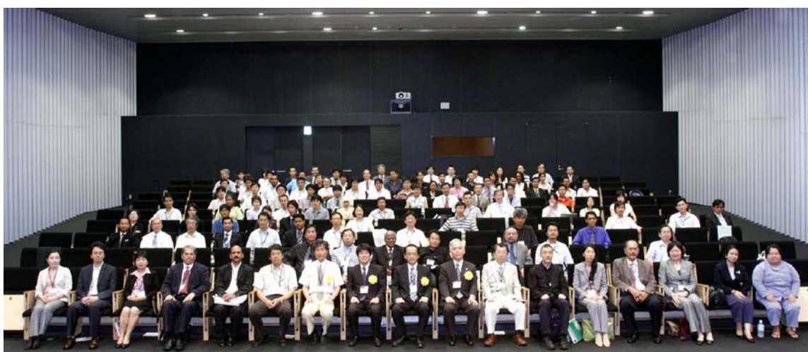
All the symposium participants