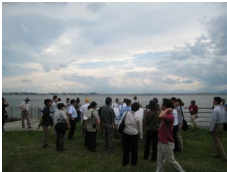
At Fujimae Tidal Flat

On the afternoon of the 19 th , field trips were made to the Fujimae Tidal Flat and Kaisho Forest, where the young researchers received explanations and held discussions on activities to conserve the ecosystems and the creatures that inhabit them.