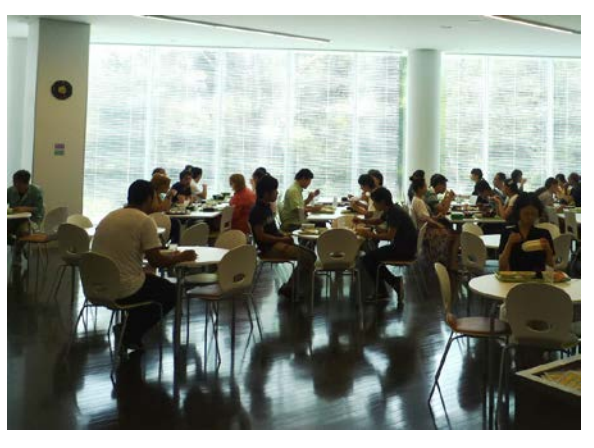
Young researchers gathered in the new cafeteria with eco system.

MANA has been making a major effort to promote fusion research. Especially the "camp" type Grand Challenge Meetings trigger new innovative research activities. Theory is becoming well fused into experiments and further use of theory is highly encouraged.