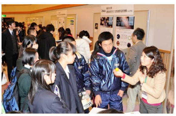
Presentations of high school students