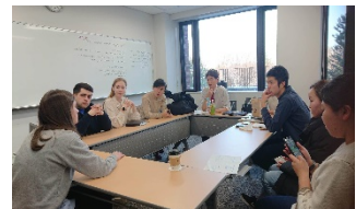
< Student Union meeting >