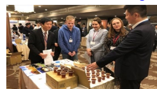
< Exhibition and the counselling Session at Japan-Russia Joint Symposium on Educational and Scientific Development in Medicine >