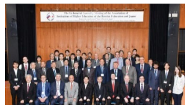
(Participants in the General Assembly)