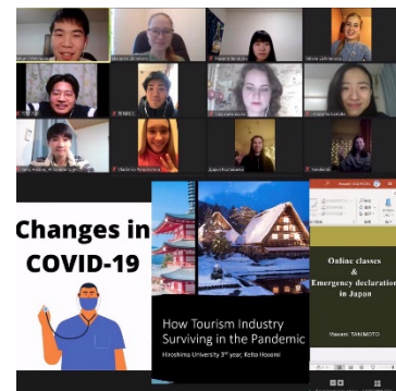
〈 Online student exchange within the Japan-Russia Student Union 〉

• In addition to renovating the website and enriching its content, we established a Facebook group as a platform for those engaged in Japan-Russia exchange to voluntarily and regularly disseminate information.