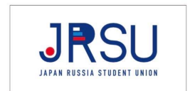
〈 Japan-Russia Student Union Logo 〉