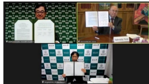
(Adoption of a communique by the presidents of Hokkaido University, Niigata University, and Moscow State University)