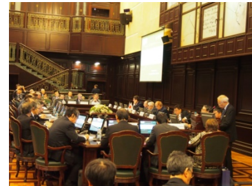
〈 General meeting of the Association of Japanese and Russian Universities 〉