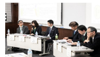
< Panel discussion >