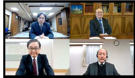
〈 Online discussion with the presidents of the core member universities 〉

• As part of the association's events, online conferences were held on themes such as "Partnerships between Japanese and Russian academia, business and local authorities" and "Global ecosystem and environmental changes in the Arctic", where faculty members and researchers from the association's member universities gave lectures and exchanged views.