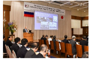
< General meeting of the Association of Japanese and Russian Universities >