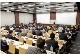
〈 Working-Level Conference Venue 〉