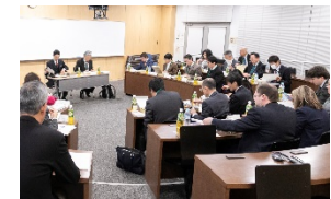
< Core Member Meeting of the Committee for Personnel Exchanges >