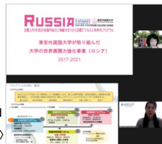
(Presentations by universities)