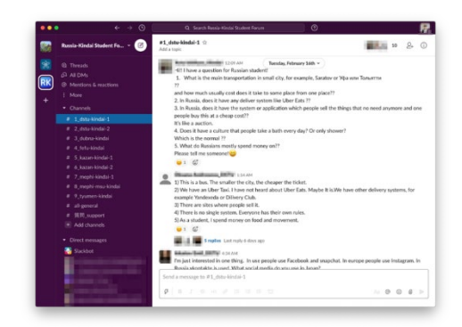
⟨ Online exchange on Slack ⟩