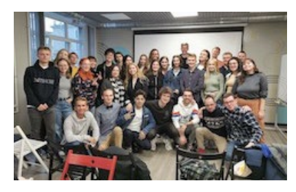
(At our partner university in Russia)