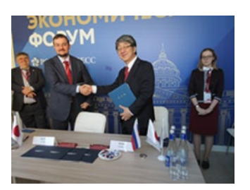
(Forming Agreements with Russian Industries)

Began accredited courses for exchange students to ensure quality assurance To develop the exchange program we created accredited courses totaling 17 credits in the Faculty of Science & Engineering for incoming students: 'Engineering Design Practicum' (12 Credits), 'Basic Seminar1/2'(2 credits each), 'Graduation Research Seminar' (1 credit). For outbound students we created in the Faculty of Science & Engineering new courses such as,' Project Management Practicum' (12 credits) and 'Russian Language 1/2' (1 credit each).