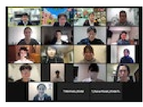
(View of the online program)