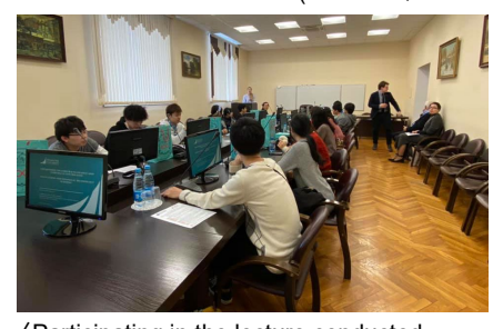
\langle \mbox{Participating in the lecture conducted} in English (outbound)>