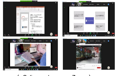
⟨ Online exchange on Zoom ⟩