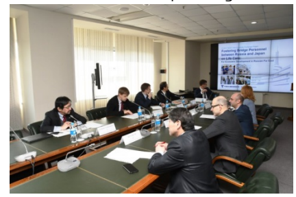
< Joint Program Committee>

Tokai University has been developing a global education environment by increasing the number of foreign language speaking staff, and actively employing professors with degrees from overseas educational institutions. Tokai University has been increasing the number of courses offered in English. IEC actively develops public relations using existing media such as the University's official website and university newspaper. Additionally, Tokai University created a special website for this project in Japanese, English, and Russian. Occasionally, IEC organizes symposia and workshops to share the results of our project as-a social contribution