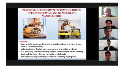
⟨Workshop on robotics online⟩