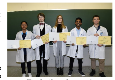
⟨The Certificate Ceremony⟩