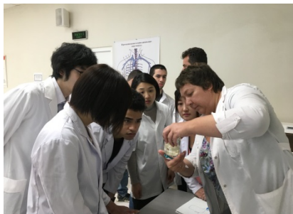
< Medical check-up training >