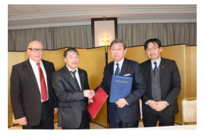
<Academic Cooperation Agreement with Sakhalin State University>