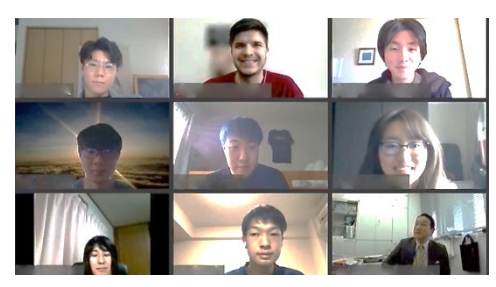
(Online exchange program)