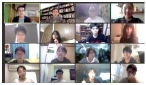
⟨Student's presentation online ⟩