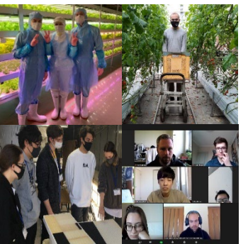
⟨Implementation of on-site training, company tours, and online classes ⟩

All the short-term internship programs and winter programs in FY2020 were conducted so that the students were accepted by the online classes offered by the FARM program. In the short-term internship program, a total of six master's students from three Russian universities participated in "Project Management" and "International Environmental Horticulture," and a total of seven master's students and undergraduate students from four universities participated in "Japanese Language Specialized in Environmental Horticulture." Additionally, a total of 10 Russian students joined the winter program. In the long-term internship program, on the other hand, two students from Sakhalin State University visited Japan to attend the cultivation management training, etc., at the plant factory. In comparison, a total of three students – one each from Primorskaya State Academy of Agriculture, Far Eastern State Agrarian University, and Novosibirsk State Agrarian University – came to Japan to attend the face-to-face class, internship, and project work.