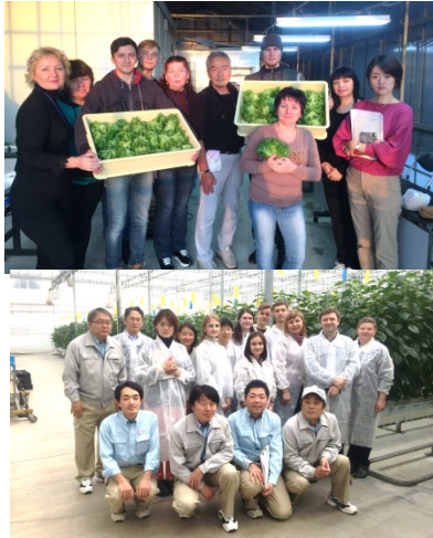
On-site training and company tours