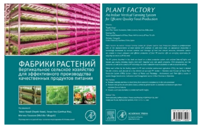
⟨ The published the Russian translation of "Plant Factory." ⟩

We had been working on translating the first edition of "Plant Factory," published by Elsevier, into Russian since FY2019. With the cooperation of Novosibirsk State Agrarian University, we were able to release the Russian translation at the end of FY2020. In FY2021, we plan to distribute the translation book to our partner universities and related institutions and companies in Russia to promote and publicize the FARM program.