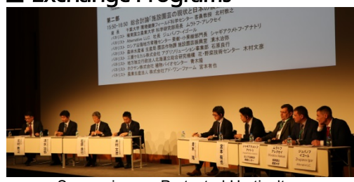
Symposium on Protected Horticulture