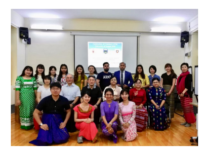
(Externship in Myanmar, Feb. 2020)