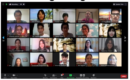
〈 Online Externship (September, 2020) 〉

Due to the worldwide COVID-19 pandemic, KLS carried out international exchange programs online base.