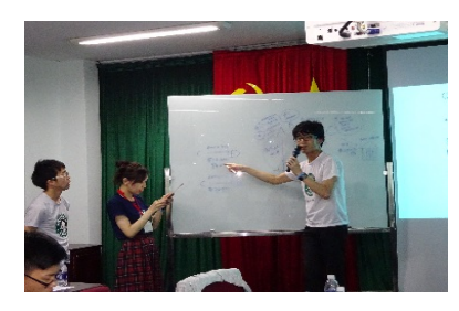
(Presentation by Japanese students at the study program in Vietnam in March 2017 )

We are applying the quality assurance system which are used by KLS-J.D. Course: the evaluation of GPA and Faculty Development. We are sharing this quality assurance system with our partner universities. Moreover, KLS has established Keio Institute for Global Law and Development: KEIGLAD and gather necessary information to make advance the PAGLEP.