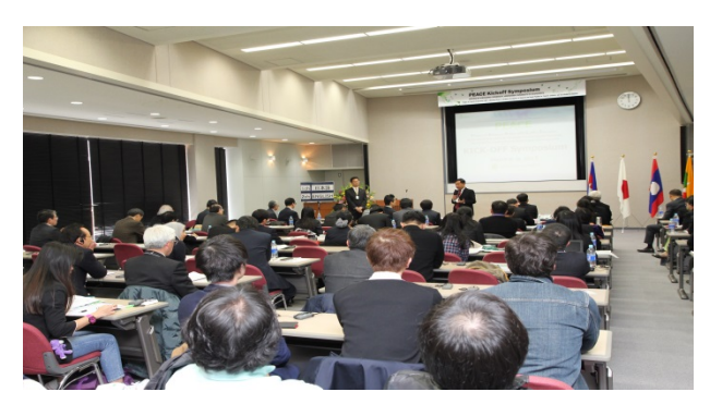
PEACE Student Exchange Program Kick-Off Symposium