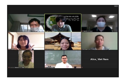
⟨Collaborative Online International Learning (COIL)⟩ ⟨SDGs Ideas Mining Student Seminar⟩