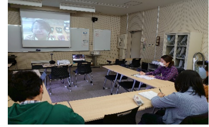
〈 Online Lecture Provided by SALASUSU as Part of PEACE Study Tour in Cambodia 〉