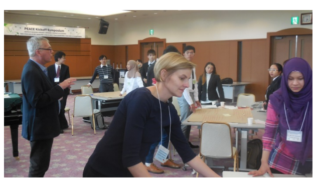
PEACE-SDGs Idea Mining Student Seminar, coordinated by idea mining experts from the University of Münster, Germany