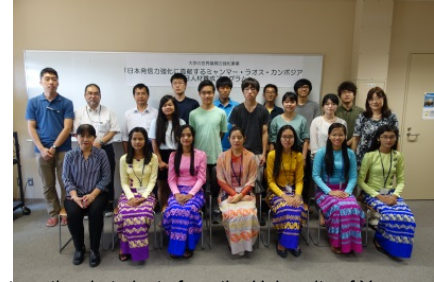
International students from the University of Yangon

- International students at TUFS participated in tandem learning programs with TUFS students studying Burmese, Lao and Cambodian, and they took Japanese language classes and classes related to Japanese culture.