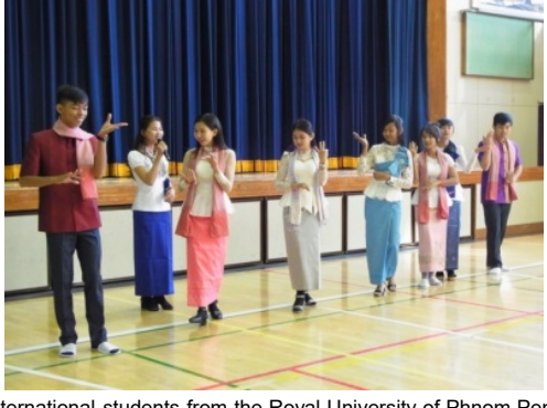
International students from the Royal University of Phnom Penh (Cultural interchange at an elementary school)