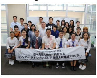
International students from the National University of Laos (opening ceremony for the short-term Joint Education Program)

- International students at TUFS participated in tandem learning programs with TUFS students studying the language of the country from which the international students came. In addition, international students took Japanese language classes and classes relating to Japanese culture. They were able to deepen their understanding of the Japanese language and culture.