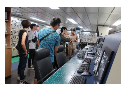
Short-term dispatch / Visiting the training ship Hanbada at Korea Maritime and Ocean University