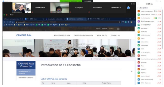
1st OQEANOUS Joint Information Session (Online)