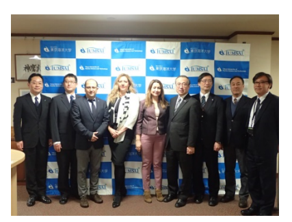
<Roundtable discussion with universities such as Ege University>

In this project, a guideline was created for the Credit Transfer System in East Asia (CTSEA), which is a credit transfer system among three universities. Along with it, a scheme to execute a learning agreement with each student will be implemented. All of these information will be released on the university's website and, based on the results of this program, we will aim to expand the system in the future to other universities in Japan, China, and South Korea and develop it into student exchange with ECTS-accredited and ACTS-accredited schools.