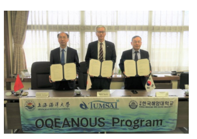
Conclusion of a Double Degree Agreement and Agreement Relating to Credit Transfer Among Maritime Universities @ TUMSAT

With a view to assuring the quality of education, we created a CTSEA Survey Form for objectively carrying out the evaluation of this program, and shared details on how to implement this survey among the three universities. Also, after carrying out this survey with the first cohort of students, we summarized and analyzed the results. From now on, we plan to share these results among the three universities and, while working to understand and improve any problem areas, link them to quality assurance. In the future, we aim to increase the number of subjects covered by the survey to approach even more reliable quality assurance, and to expand to student exchanges with ECTS and ACTS-accredited schools.