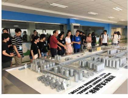
Observation tour of Bright Dairy & Food Co.,Ltd. on Summer School in Shanghai