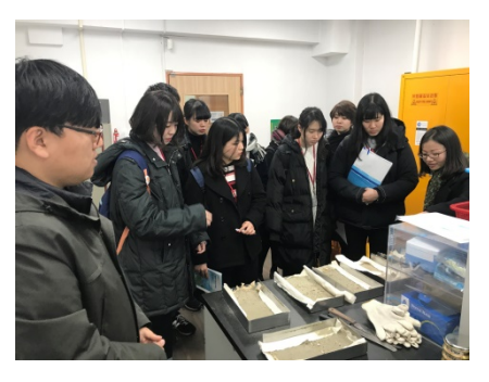
Laboratory tour on Short-term visit program at Korea Maritime and Ocean University