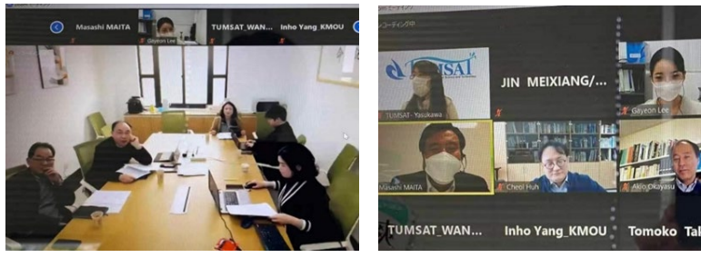
14th OQEANOUS Meeting (Online)