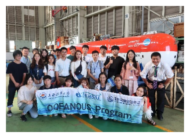
Summer School at JAMSTEC