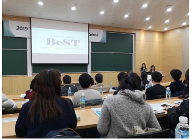
〈 Winter Program in Seoul 〉