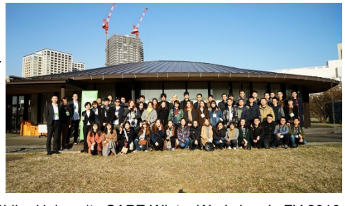
Chiba University CAPE Winter Workshop in FY 2016

In FY 2016, Chiba University, Tsinghua University and Zhejiang University in China, and Yonsei University in Korea each held at least one workshop for a total of five. A total of 263 students (including students not from partner universities) participated. An international symposium where faculty members and students from each university presented their research was held at the Kashinoha Campus, Chiba University in February. In FY 2017, each university continues to offer workshops as well as aims to increase the number of students participating in long-term study abroad programs.