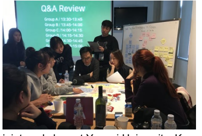
The joint workshop at Yonsei University, Korea