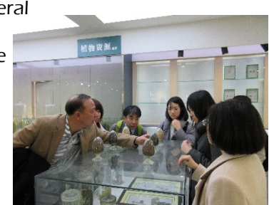
\langle Environmental and life science seminar in Jilin University \rangle