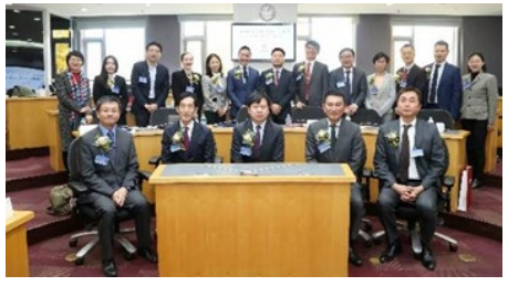
BEST Symposium >