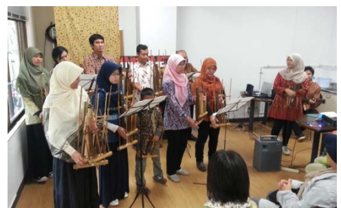
〈Mini-Concert at the Global Café〉