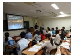
Presentation by outbound students

Support by university overseas office and coordinators Emergency procedures by OSSMA (Overseas Student Safety Management Assistance)