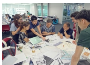
〈 Joint Design Workshop with Chulalongkorn University @ MAC 〉