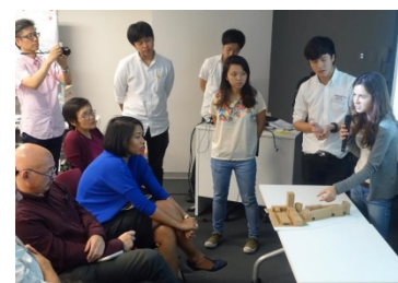
〈Joint workshop hosted by GS of Science and Technology〉

A dedicated website cutover in April 2014, which enabled us to instantly publicize the outcomes of the project in Japanese and English.