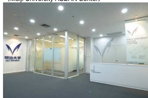
(Meiji University ASEAN Center)