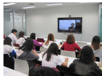
〈Distance-learning at MAC〉