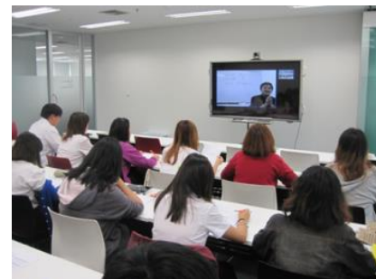
Distance-learning at MAC

*SEND : The aim of the program is for Japanese students who study abroad to learn a different language and culture, and, in exchange, to assist in teaching the Japanese language and introducing Japanese culture, thus promoting cross-cultural understanding, while training them to become experts who can build cultural bridges between Japan and ASEAN countries. (Defined by MEXT)