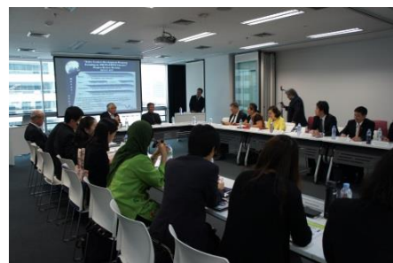
PICs meeting at MAC

PICs from partner universities and other educators get together at MAC in Bangkok, and discuss the topics regarding achievements and possibilities of student mobility and further collaboration.