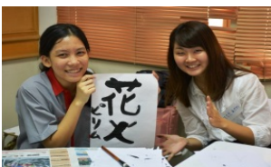
〈 SEND activities with student in SWU PSM Demonstration School 〉

Besides long-term student exchange with partner universities, many schools implemented Short-term programs in conjunction with MAC. <School of Political Science and Economics (SPSE), School of Information and Communication, School of Agriculture, Graduate School of Science and Technology etc> The Short-term programs also implemented in ASEAN Partner universities such as De La Salle University, Ateneo de Manila University, HCM-USSH and National University of Laos etc.