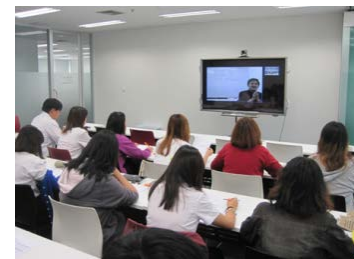
〈Distance-learning at MAC〉