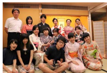
〈Short-term program attendees from Vietnam〉

Full-time staff (Japanese and Thai nationality ) is stationed in MAC and they provide academic and livelihood support for Japanese exchange students in Thailand.