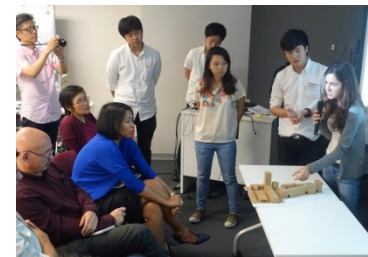
〈Joint workshop hosted by GS of Science and Technology〉

A dedicated website cutover in April 2014, which enabled us to instantly publicize the outcomes of the project, as well as to share experiences of students who have studied in Japan/ASEAN countries. That motivates other students to study abroad.