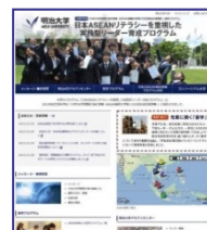
〈 dedicated website 〉

In addition to Japanese and English version, Thai version of the "Meiji University Guidebook" is newly issued and distributed at Study Japan Fair for students in Thailand, where our overseas educational hub "MAC" is located.