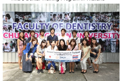
TMDU Dental Training Program in Thailand