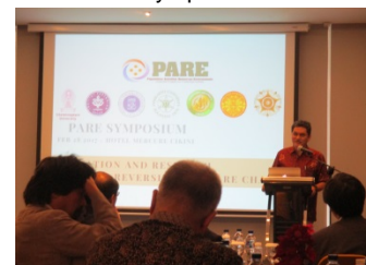
< International Symposium at Jakarta >