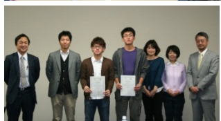
〈 FY2012 The debriefing session of dispatch students 〉