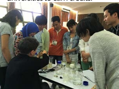
2015 Short Program in Thailand