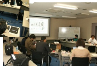
〈 FD Workshop 〉