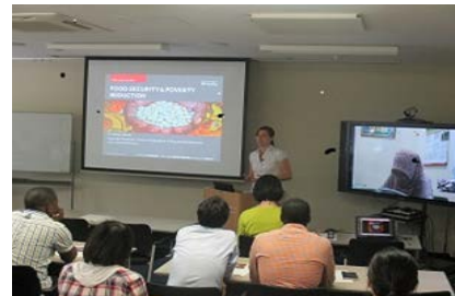
Joint lecture by professor from University of Reading