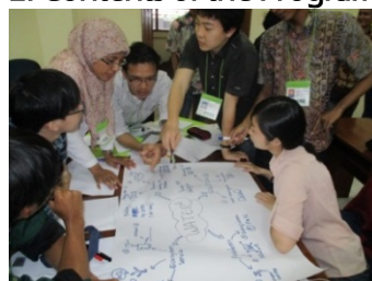
(FY2014 PARE Short Program in Indonesia)