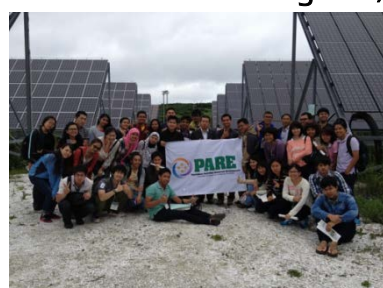
(FY2013 PARE Summer School in Hokkaido)

The Program was also highlighted by faculty staff at various conferences within and outside Japan.