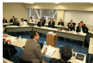
〈 National Steering Committee 〉