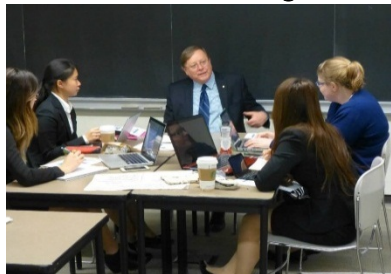
Japanese and Canadian students working together during the GCS in Canada