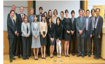
〈TEACH Opening Ceremony〉

A total of five students from four partner universities in Europe were accepted. Students followed lectures in the humanities and social sciences. Also, students from the University of Tsukuba were dispatched to Europe to further their own research in comparative studies of contemporary Japanese and European societies.