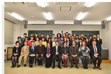
〈TEACH Opening Ceremony〉