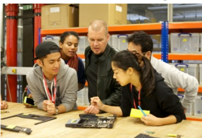
〈Keio students in class at RCA/Imperial, UK〉