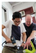
At GID Short Program