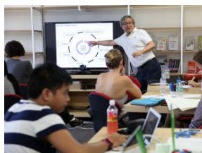
From GID Pre-Program