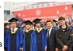
〈2015/3/21 Graduation at SJTU〉