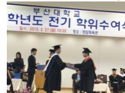
〈2015/2/27 Graduation at PNU〉