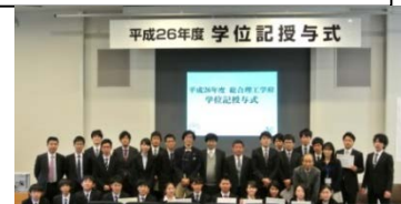
〈2015/3/25 Graduation at KU〉

The evaluation of the EEST program by the external review committee was carried out. The committee gave quite high mark by our successful outcome.