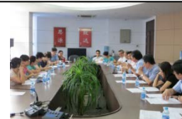
〈Int'l PDCA meeting at SJTU〉

External evaluation of the EEST program by International exchange planning committee of KU was carried out. The committee gave quite high mark and encouraged to continue the program.