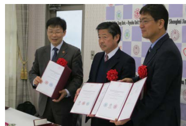
〈 DD Singing Ceremony at KU 〉

To realize DD and non DD courses in EEST program, Curriculum, Credits award and way of Degree award with quality assurance are established after discussions among 3 universities.