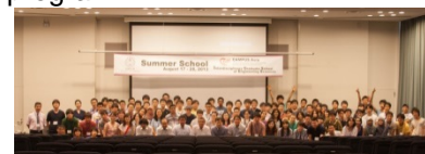
〈 Opening 2nd Summer school 〉

KU hosted the 2nd Summer School for 10 days in the mid of Aug. Total of 91 students participated, including DD students, non DD students and 10 students invited from Asian countries to make the program more international. 3 credits and the Certificate of the completion were awarded to them.