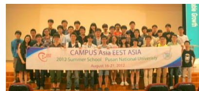
〈 Tour to LG Electronics Inc. at Busan 〉

Each 3 Universities dispatched 3 students and accepted 3 students to/from for one semester in FY 2013 as the trial-run for future DD course. The exchange students participated in the curriculum course for future DD students.