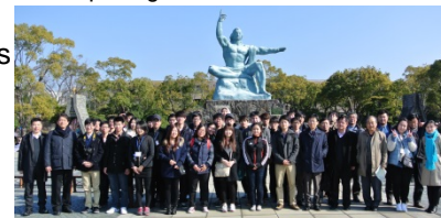
〈Spring Seminar Filed trip to Nagasaki 〉

To enhance international students exchange, SJTU hosted CSS (Cross Straights Symposium) EEST #15 in Nov. Total of 138 graduate course students (KU49, PNU 68, SJTU 21) including 11 EEST course students attended and enjoyed presentations/discussions among them.