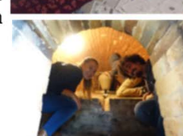
(pottery workshops using a climbing kiln)