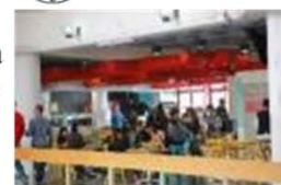
(Campus of Bezalel Academy of Arts and Design)

[Inbound] TUA accepted four students from Bezalel Academy as long-term exchange students to provide opportunity to learn Japanese arts and culture. Besides, in summer, two students joined TUA's annual research trip to Nara and Kyoto. The students visited temples and shrines with the guidance of the faculty specializing in ancient art. Three other students came to Japan to take part in a workshop on Societal Design in Northern Europe that was co-organized by TUA and Finnish educational institutes.