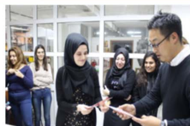
(Workshop at Anadolu University)

[Inbound] TUA's Intermedia Department hosted a long-term exchange student from Anadolu, who visited exhibitions related to TUA's faculty members as well as taking regular classes along with Japanese students. TUA also hosted ceramic students, who participated in pottery workshops using a climbing kiln, the main type of kiln used in Japan. The students were asked to bring their unfinished works that were made of clay from Turkey and worked with TUA students around the clock to have their work fired in the kiln. Two other painting students visited Geidai Factory Lab, where was newly opened aimed at providing opportunities for the public to experience craft activities, and learn how to make Washi Japanese paper.