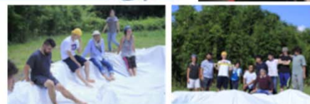
(Students of the two countries worked together)

[Inbound] Students at Mimar Sinan visited Japan to join workshops hosted by TUA. Two architecture students participated in one on how to design urban space in Tokyo, which was held in collaboration with Bond University of Australia. Besides, Mimar Sinan and TUA organized a joint-workshop on the relationship between space and sculpture. Two students majoring in sculpture at Mimar Sinan joined it.