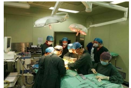
⟨Practice at the operating room = Niigata University⟩