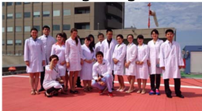
<Summer medical student exchange program 2015>

2014 was a preparation period in order to establish a full-fledged program, so we laid the groundwork of future student exchanges which will in fact start in 2015. At first, we have established a Control Center which consists of competent professionals with necessary language skills and rich international experience in order to set up the collaboration with partner universities in a close contact. In addition, a booklet, leaflets were issued and project website was created in order to introduce this project widely, not only in medical campus but within the whole university. Sessions of Internal and External Steering Committees, Evaluation Committee hearing were held; people in charge of the project and Control Center personnel visited partner universities several times, held meetings and carried out FD in order to explain the program content fully; administrative and management systems of the project were set up.