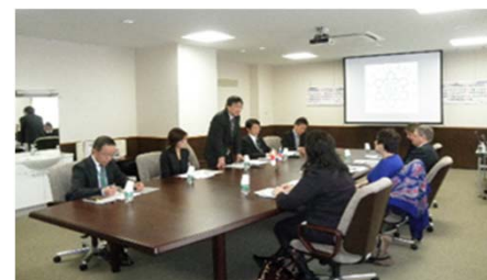
<Conference on International Cooperation Management >