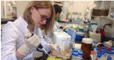
〈Graduate student performing the experiment〉

Four exchange programs started in 2015: “undergraduate student exchange” (Summer exchange program・Autumn medical research training program) and “graduate student exchange” (Regular PhD program<RPP>・Double degree program<DDP>). “English” is the language of the project. According to the agreement signed with three universities, FD and presentations of research projects were organized; project’s office on the Russian side (Krasnoyarsk State Medical University) was set up to coordinate student exchanges and research activities. This program graduate’s association was organized in order to maintain friendly relations after studying abroad. Working Group Committee, Steering Committee, Internal and External Evaluation Committees meetings were carried out, so as a result up to the moment the project was successfully implemented. Results of all four programs were summarized in a booklet, as well as project’s homepage was created demonstrating achieved results and giving all the necessary information available not only to Niigata University, but to other universities too.