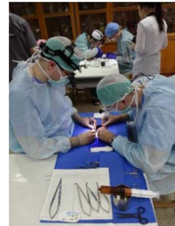
〈 At Far Eastern Federal District Regional Student Surgical Olympics 〉

Administration of the entire project and public relations are carried out by Control Center. International Cooperation Steering Committee was held four times last fiscal year and at the end of the fiscal year Internal and External Evaluation Committee meetings were held. Results of the consultation and advice from evaluation committees were included in the business plan of this fiscal year and widely reported on symposiums, workshops and FDs. Results of this inter-university exchange project can be already seen and it continues to spread to other medical universities in Russia. It is planned to engage more Russian universities in the project. St. Petersburg State University, North-Eastern Federal University (Yakutsk) and Kazan Federal University plan to join Summer Exchange Program.