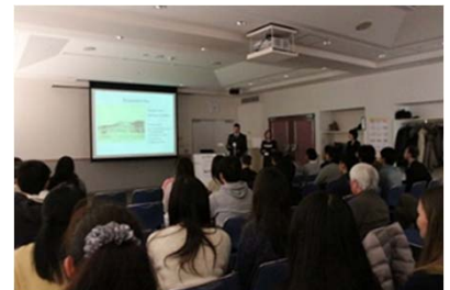
〈Russian students making presentation at the public lecture〉

“Healthcare center” which consists of four doctors including psychiatrist was established within the University to support foreign students. This organization can take care about physical and mental health of students. We also made a list of 8 hospitals located in Niigata city where students can communicate with doctors in English, so students can go there if they have health problems and in case of emergency as well. As for the Japanese language learning support, it should be mentioned that invited lecturers gave a course of lectures in “Medical Japanese”. From 2016 Japanese became a part of syllabus for foreign students of the Medical and Dental Schools. Niigata University together with partner universities organized “Japan-Russia Emergency Contact Network” for inbound and outbound students, assistance is available 24 hours a day. For both Japanese and Russian students fully equipped accommodation within the campus or near is available for free.