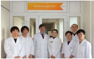
⟨Students studying at "Japan-Russia Center of Microbiology, Epidemiology and Infectious Diseases"=Krasnoyarsk State Medical University⟩