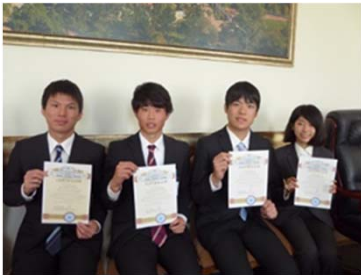
〈 Students of Niigata University with certificates of completion 〉

Construction of the global framework promoting the collaborative education and career development for young medical students in Japan and Russia