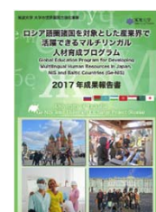
(Program outcome report 2017)

Two Japanese students from this program participated in the "Russian-Japanese Student Forum 2017" held in Vladivostok in September of 2017. The proposals discussed and compiled there were later presented to Prime Minister Abe by one of them.