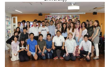
(Graduation ceremony for inbound students, August 2017.)

In February 2018, Program Outcome Report was published. In addition, with the renewal of the program's website, program outcomes were circulated.