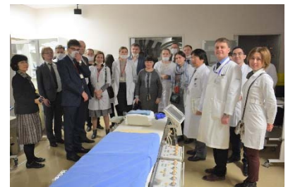
"Cooperation of young Japan-Russia medical specialists in regional medical care" Held in collaboration with Niigata University and Japan-Russia Youth Cooperation Center (February 2017)