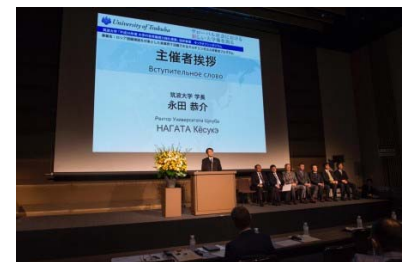
〈Symposium held on February 15, 2015〉

In February 2015, the Symposium to mark an official start of the project was launched. 15 delegations from partner universities (approximately 70 guests) discussed the issues of networking and collaborating between universities.