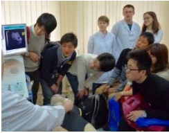
〈during an outbound internship〉