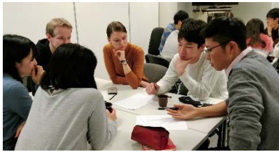
(Discussion by Japanese and Russian students during an economic forum. February 2018.)

The University of Tsukuba Hospital accepted 10 medical students for a one-month practical training (Department of Renal urology, Department of Cardiovascular surgery). One medical student from the University of Tsukuba participated in a clinical training at the Russian National Research Medical University (Department of Trauma surgery).