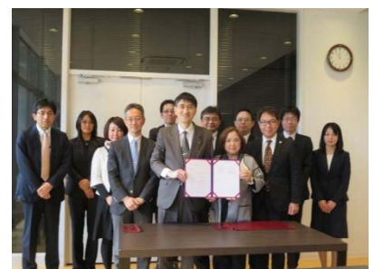
Signing agreement on academic cooperation with Tohoku University (March 2017)

In March 2017, an agreement on academic cooperation was signed between the "Global Education Program for Developing Multilingual Human Resources in Japan, NIS and Baltic countries" of the University of Tsukuba and the Tohoku University.