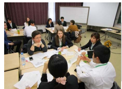
Discussions between Japanese and Russian students at the Japan-Russia student forum December 2015

New courses of "Internship abroad" and "Internship in Japan" (2 credits each) started in 2015 and a launch of "Project internship abroad" course in 2016 was finalized. These courses will ensure preserving a high quality of educational activities to inbound and outbound students.