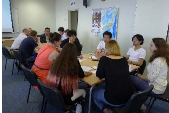
Discussion during an economic forum in Moscow (June, 2016)

Outbound students were in charge of organizing economic forums to enhance the cooperation between Russian-speaking countries and Japan. The forums focused on job-hunting and employment opportunities, tourism etc. Students from Russia and NIS countries studying in Japan obtained internship experience at homebuilder company Iida Sangyo Co., Ltd., where they were assigned practical tasks of proposing business plans etc.