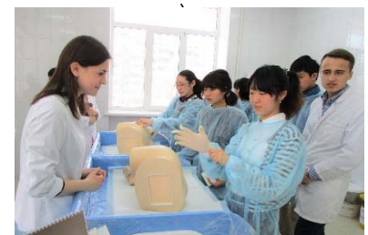
(Medical training, March 2017. Novosibirsk State Medical University)

57 students out of 64 Japanese students who took part in the Program received credits for their study abroad/foreign internship. Program courses include "Project training abroad" (2 credits), "Internship abroad" (2 credits), "Clinical clerkship III" (11 credits), which have been incorporated into curriculum of the University of Tsukuba. Awarding credits for internship courses ensures preserving a high quality of the program's educational activities.