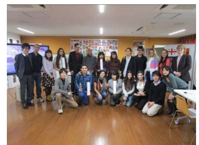
Japanese language and culture internship (December 2016)

Agreements on academic exchange with leading universities in Caucasus (Azerbaijan, Armenia and Georgia) and Moldova (Azerbaijan University of Languages (Azerbaijan), Free University of Tbilisi (Georgia), and Russian-Armenian (Slavonic) University (Armenia) and Moldova State University (Moldova)) were signed. This has marked a new level of cooperation with the Russian-speaking countries. In December 2016, Japanese language instructors from five countries participated in a Japanese language and culture internship held at the University of Tsukuba.