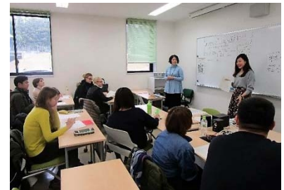
(Japanese language and culture internship, December 2017. University of Tsukuba)