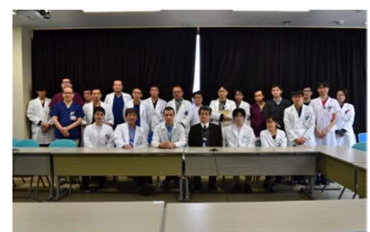
Internship students and staff of the University of Tsukuba Hospital

In May 2016, 2 medical students started their 1 month clinical training at the Russian National Research Medical University. The training is carried out within the framework of the "Medical training abroad" program (11 credits).