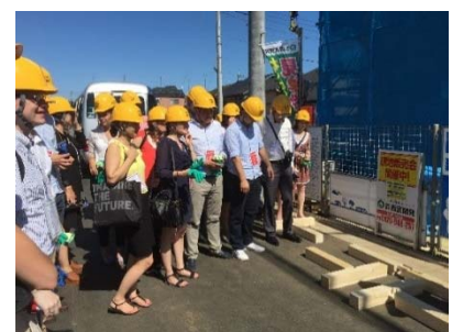
Internship in Japan for foreign students July 2015

With the aim of starting academic exchange with leading universities in Caucasus (Azerbaijan, Armenia and Georgia) and Moldova , in December 2015 faculty members of the University of Tsukuba went to Caucasus and Moldova and held discussions on the subject. As a result, Agreements on academic exchange were signed with Azerbaijan University of Languages (Azerbaijan), Free University of Tbilisi (Georgia), and Russian-Armenian (Slavonic) University (Armenia). Signing Agreement on academic exchange and starting cooperation with Moldova is scheduled to take place in 2016.