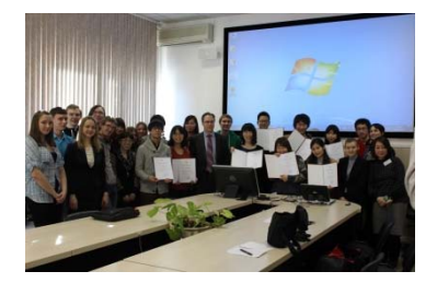
⟨ Tohoku University Cross-Cultural Program with Russia ⟩