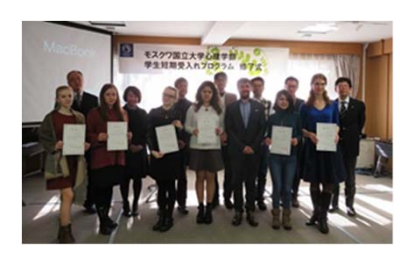
⟨Closing Ceremony for exchange students from the MSU's Faculty of Psychology enrolled at the TU Graduate School of Arts and Letters⟩