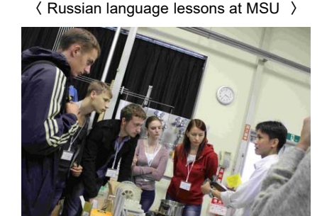
〈 Engineering Lab tour at TU 〉