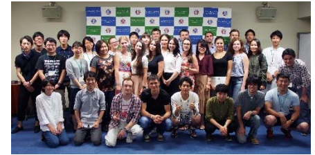
Japanese and Russian students taking Basic Subjects in FY 2016

East Russia – Japan Expert Education Program (RJE3 Program)