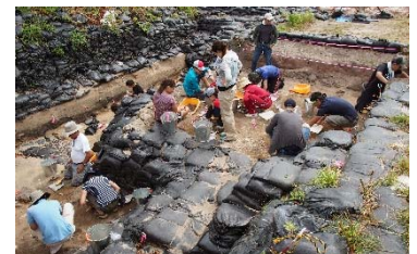
International Field School on Rebus Island Hamanaka 2 site, Rebus Island Basic Subject fieldwork

A total of 47 Japanese and Russian students participated in four activities: (1) fieldwork involving environmental observation in Yakutsk, Russia; (2) archaeological and anthropological fieldwork on Rebus Island, Hokkaido; (3) fieldwork on developmental technologies in cold areas of Sapporo and its surroundings; and (4) a new fieldwork program on northern-region culture and environmental conservation in Shiretoko and Sapporo.