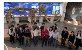
Short-term dispatch of Hokkaido University students under Prep subjects (Yakutsk)

By ensuring the consistency of advanced courses in educational curriculums and registering advanced courses as regular ones, arrangements were made to offer them the following year.