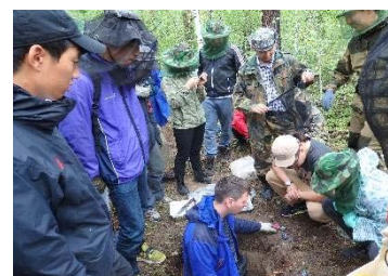
(Basic Subject – Practical training in Yakutsk: permafrost soil survey)