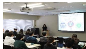
Completion report by a Russian student at Sustainable Development Study Group