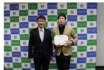
(RJE3 joint completion certificate award ceremony)