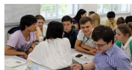
Discussions between Japanese and Russian students in Basic subjects (introduction)