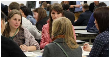
Lecture on a basic subject (trial)