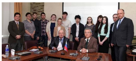
Japanese and Russian academic staff and students at a lecture on a prep subject