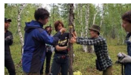
Fieldwork activity involving environmental observation in Yakutsk as part of Basic subjects