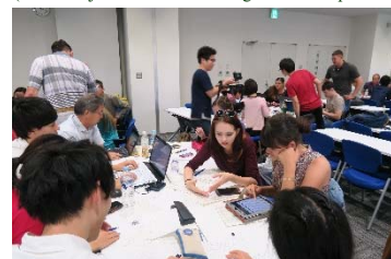
(Basic Subject – Introductory course: discussion among Japanese and Russian students)