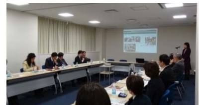
〈Project Outcomes Evaluation Meeting on March 4th〉

In 2016, to strengthen the collaboration, Sophia University visited 5 partner universities in Brazil, Colombia, Chile; Nanzan University visited a partner institution in Mexico. An orientation for this Program was held for students at the institutions. The interaction among the three Japanese partner universities led to promotion of student exchange with Latin-American region and in March, Nanzan University concluded a student exchange agreement with a Colombian university, one of the 13 partner institutions with which Nanzan did not have any agreement. Nanzan visited an institution in Argentine with which it did not have any agreement to discuss the possibilities.