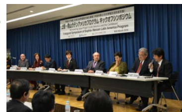
〈 Inaugural Symposium of March 18th 〉

Sophia University concluded student exchange agreements with 4 partner universities which had not yet concluded in this program, and strengthened the cooperation with 9 universities which had already concluded. On March 17th, a program development meeting was held at Sophia University, inviting officials from 7 partner universities in Latin America, and discussed the expected role of this program.