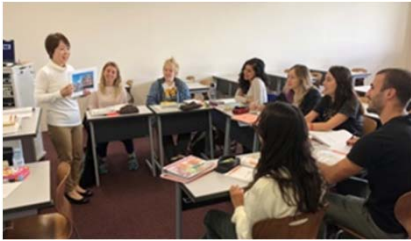
〈Intensive Japanese Course〉

The 2017 exchange program showed results exceeding the proposed target numbers for both outbound and inbound students. In August, 11 students from Nanzan and Sophia universities participated the intensive Spanish course at Pontifical Javeriana University. The first attempt was made this year for students to stay at the homes of faculty and staff members of Javeriana. Students were given opportunities to improve Spanish proficiency both on and off campus and to deepen the understanding and interest in the Columbian culture. For inbound program, the domestic multi-campus system had 18 inbound students who first participated in the Intensive Japanese Course at Nanzan, then moved to Sophia and took courses in their major field of study. The Intensive Japanese Course offers the students a smooth transition to life in Japan by acquiring the most basic Japanese language required for daily needs and understanding the culture and customs. Next, the students attended classes to gain deeper understanding of the relationship between Latin America and Japan. The students were given hands-on experience through visits to various enterprises and institutions and participation in activities.