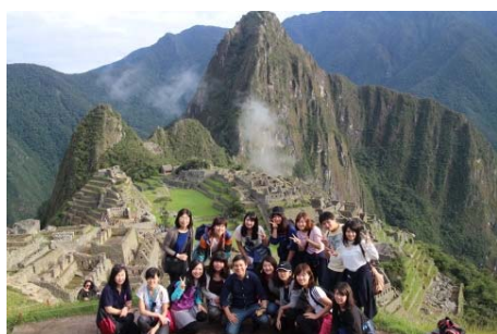
〈 Peru Study Tour 〉