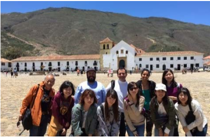
〈Intensive Spanish Course at Pontifical Javeriana University〉