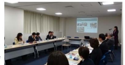
〈Presentation/Experience sharing session December2017〉

Besides, the administrative staff from 6 partner universities were invited to a Staff Meeting held in March attended by all program staff members to share the interim evaluation results of this project and discuss future efforts.