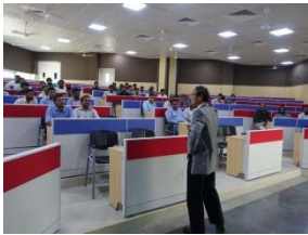
〈 Lecture by NUT faculty in India 〉

In FY 2014, we exchanged faculties and students to discuss about establishment of Joint degree program and quality-assured credit transfer scheme and seek a possibility of overseas internship in both countries. As a part of faculty exchange and trail of cooperative education, both parties gave lecture and supervise experiment at partner university.