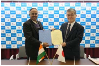
〈 The presidents from NUT and IIITD&M Signing Ceremony of credit transfer agreement〉

In FY 2016, we continued to work on an establishment of quality-assured credit transfer system and joint degree program between Indian Institute of Technology Madras (IITM) and Indian Institute of Information Technology Design & Manufacturing (IIITD&M).