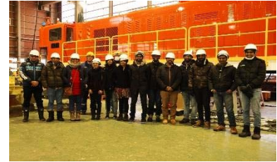
〈Study Trip for Indian Exchange Students〉

-In order to attract students to study abroad, we created motivating environment by offering various study programs and by holding a presentation session for students to introduce their experience in abroad.