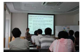
〈 pre-departure guidance by Indian professor 〉