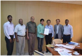
〈 Grant international student certificate 〉

In FY 2015, we worked on an establishment of quality-assured credit transfer system and joint degree program between IITM and IITD&M. For the sake of long-term overseas internship expansion, we negotiated with some companies and research institute in Japan and India.