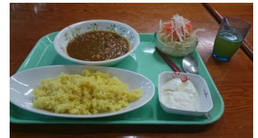
〈 Vegetarian meal 〉