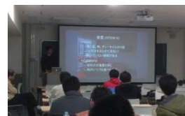
〈 Pre-departure guidance / Report presentation by Japanese students who studied in India 〉