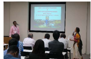
〈Lecture at IITM/ NUT Joint Seminar〉