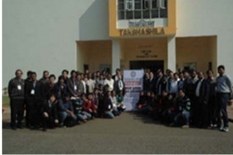
Winter seminar at IIT Kharagpur