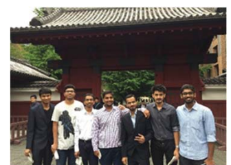
⟨IJEP internship students⟩