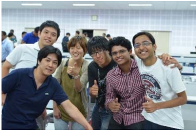
Innovation school at IIT-H

5 programs in progress for promoting India-Japan educational collaboration