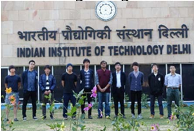
〈Visit to IIT Delhi〉