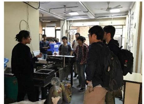
⟨ Lab visit at IITD ⟩