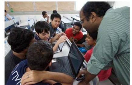
〈WS at IITH〉