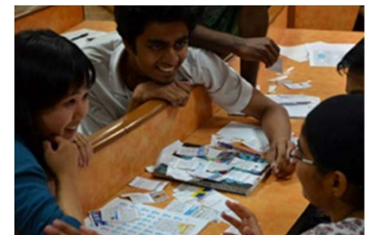
Innovation Workshop at IIT Hyderabad