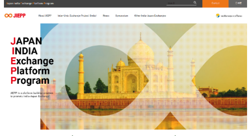
〈Picture1: JIEPP Website〉