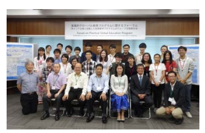
Short-term Program in Niigata