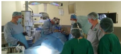
<Medical Check-up Training>

In FY2017 Tokai University conducted four short-term programs to prepare and strengthen fundamental cooperation with its partner universities for middle and long-term study abroad programs planned for 2018 and later. Through these programs, students not only discussed social programs rooted in life-care situations in Russia and Japan but also learned about advanced technology in the field of medical and health care. In order to offer students opportunities to further their professional knowledge and ideas in this project, a launch symposium was held in Tokyo while an internship program was conducted at the Vladivostok Hokuto Diagnostic Imaging Center.