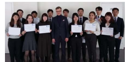
<Certificate Award Ceremony at Far Eastern Federal University>

Tokai University's International Education Center and Head Office of International Affairs work closely together so that the University can guarantee the quality of student support. At the end of every year, both internal and external independent evaluation committees review Tokai's programs and their performance. All the partner universities serve in the Cooperation to discuss and establish a common evaluation system for the double-degree program planned between Tokai University and its partner universities.