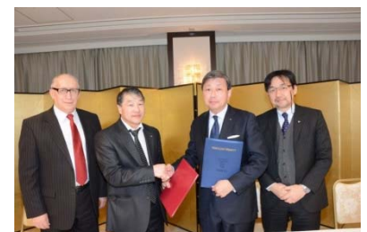
<Academic Cooperation Agreement with Sakhalin State University>

For international students studying at Tokai, the International Education Center offers an excellent support with experienced specialists. The support ranges from pre-program assistance to post-program care. The center has a variety of established student support systems which ensure the safety of students with crisis management while they focus on learning in their visiting countries. Full-time faculty and staff who are assigned to this project can maximize their performance of study abroad and internship programs.