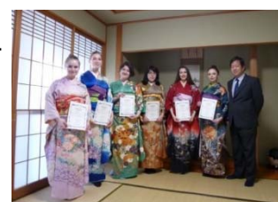
〈Completion of Cultural Exchange Program〉

We held a study abroad report session for the FY2017 student exchange program. It was an opportunity for the participants to look back on their experiences, and there were many questions about Russia from those who heard the reports. It was an excellent event to increase the interest in Russia.