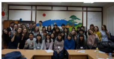
〈Student exchange with KFU〉

In order to implement the student exchange programs, we have set up the Program Management Committee, Basic and Advanced Science and Technology Program Committee, Preventive Medicine Program Committee, Cultural Exchange Program Committee, and Quality Assurance Committee. We have sent out students in Cultural Exchange Program and Advanced Science and Technology Program (Environmental Science), and received students in Cultural Exchange Program. In terms of Basic Science Program, Advanced Science and Technology Program (Mechanical Engineering, Information Technology) and Preventive Medicine Program, we are preparing for the implementation in FY2018.