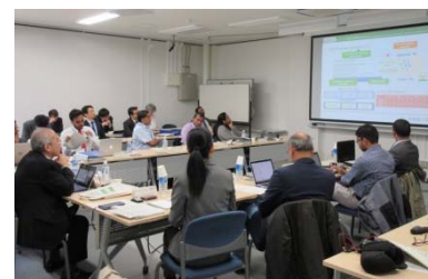
〈International Steering Committee Meeting〉

Approval of credits and certification of program completion will be strictly managed by the International Steering Committee. Feedbacks from students about each subject and curriculum will be accumulated and evaluated for future improvement of this program.