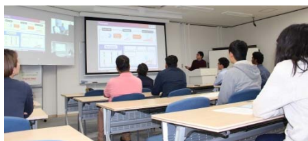
〈Final presentation by students after internship〉

Students were dispatched and accepted for short-term internships at Hokkaido University and IIT Hyderabad and Madras from February to March, 2018. TV conference system were used so that students from both sides could participate in the preliminary basic course to learn program overview, information of each university, basic languages and culture of each other. Final presentation sessions at the end of internship were also held via TV conference system, and both side of supervisors could question and give comments to the students.