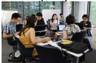
〈2017.8.9 Group Work at Summer School〉

• An assistant professor was newly hired, and “CAMPUS Asia courses” on Conflict Resolution and Social Innovation started from April with over 150 students. Besides, “CAMPUS Asia related courses” were selected from each department in Waseda for deeper learners.