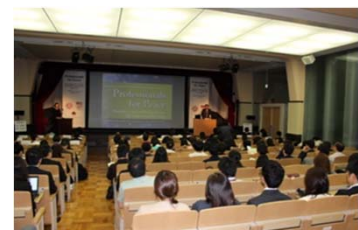
〈2017.4.20 Kick-off Symposium〉