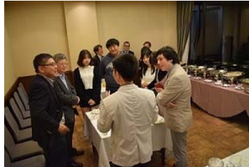
〈2017.4.19 Students and Faculties of 3 universities after Joint Workshop〉