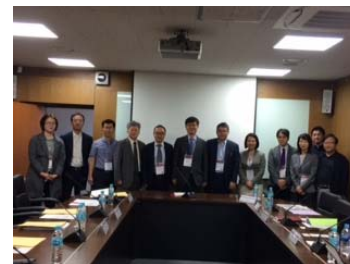
〈 2017.9.20 ICPC Meeting @ Korea Univ.〉