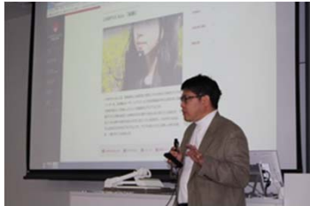
〈2017.4.3 Orientation at Waseda Univ.〉