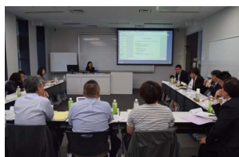
〈2017.4.19 Joint Workshop〉