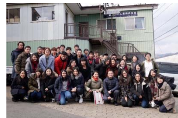
〈 2018.2.9 Visit a local company in Iwate at Winter School 〉